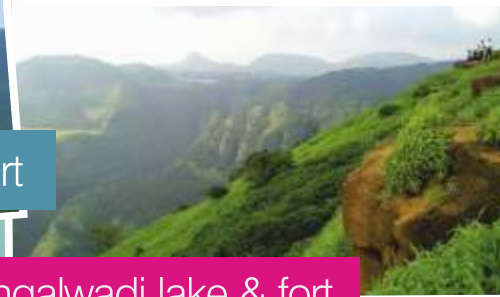
sahyadri mountain ranges