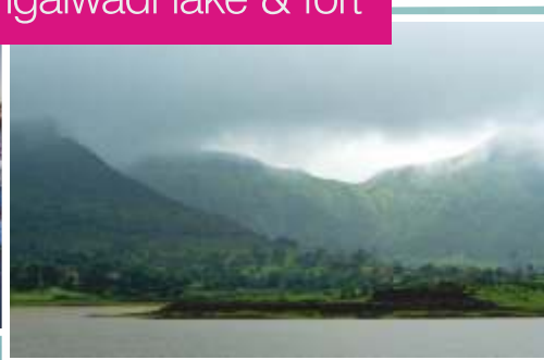
tringalwadi lake & fort

Casa Fortuna, is a beautiful project located conveniently off the Mumbai-Nasik Highway (Nh3). The quaint location i.e. Ajnup, Shahapur is one of the prettiest places in Maharashtra. It is nature-abundant, surrounded with mountain ranges. A perfect place to relax & unwind, Casa Fortuna is launched keeping in mind affordability & value appreciation. The project offers N.A. Bungalow Plots on the gentle table top land with all basic amenities like water, electricity etc. Whether as an investment opportunity or a vacation home, Casa Fortuna is a perfect gateway for nature lovers with prominent tourist spots in the vicinity.