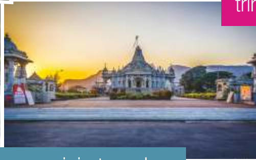
manas jain temple